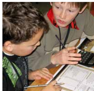
Decision-making in the Frontline simulation game

"They surprised me with their long, complex discussions and questioning. I had them form teams and then handed out a copy of the questions. They then discussed and decided. They debated their responses too. I could see the 'shock' on their faces when they had to make decisions they never thought they'd have to. It was a great eye-opening experience for them."