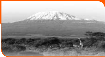
The land is hilly with steep cliffs and large flat lands

My village is in the Magugu area, which is in the north of Tanzania near Mt Kilimanjaro.