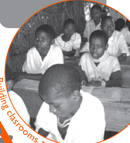
Building classrooms, training teachers