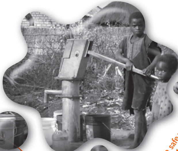
Building wells to provide safe water